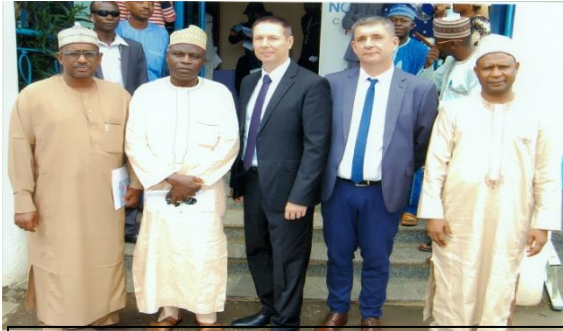
Group Photograph - 10year awardee

Nocaco has consistently been organizing an award ceremony to long serving staff ranging from 10yrs, 15yrs, 20yrs, 25yrs and 35yrs as the case may be.