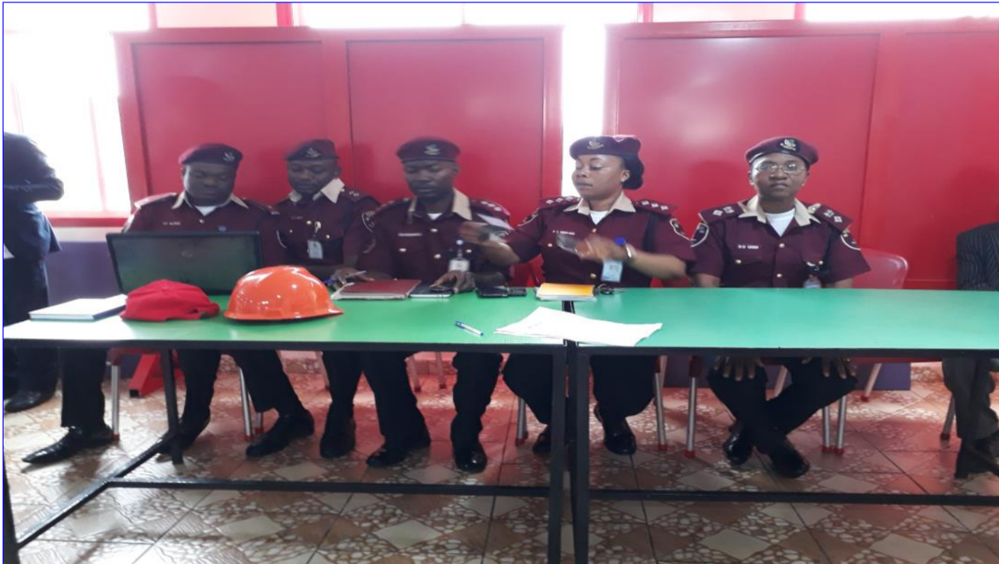
The team from Lagos State unit of FRSC in attendance and delivered a paper on “Causes and Prevention of Road Traffic Crashes “ (RTC)