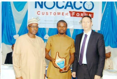
2 nd Best Customer after Receiving Award