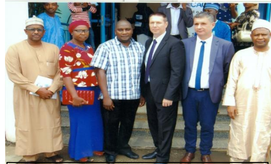
Group Photograph - 15year awardee