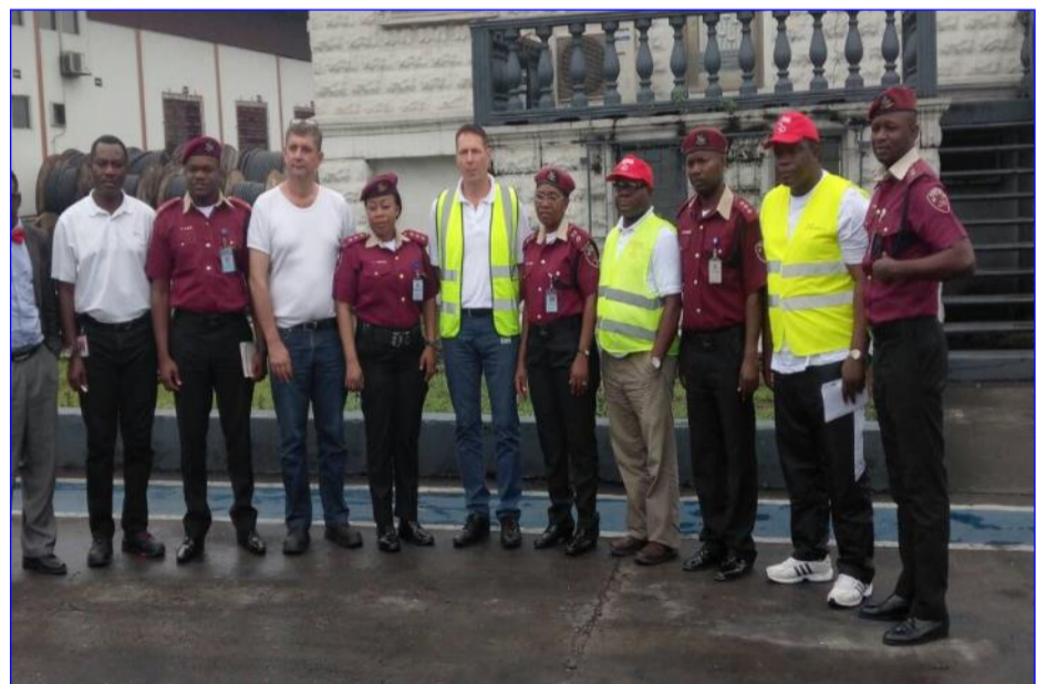
Group photograph of Management staff and the team from Lagos State unit of FRSC