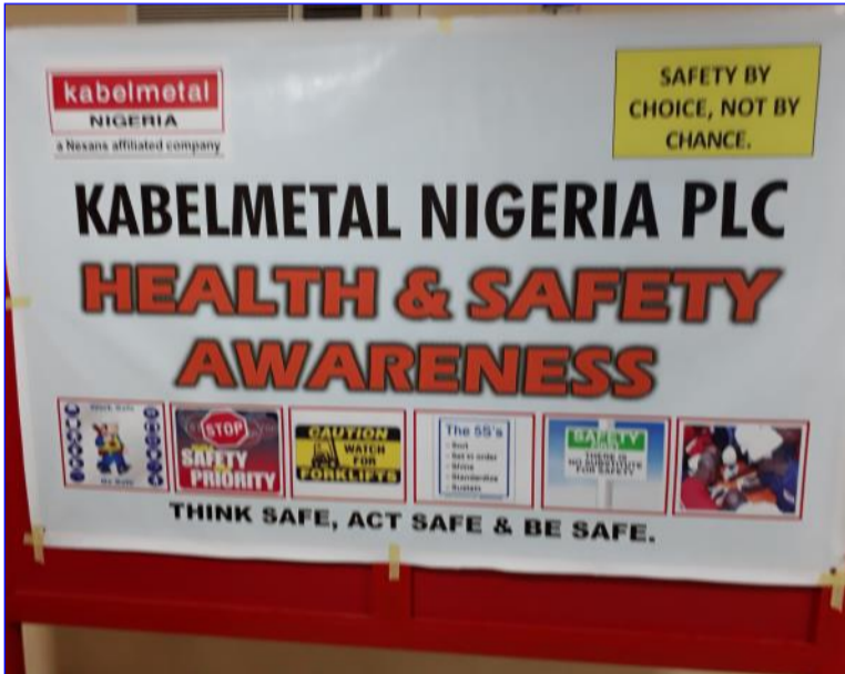
Think Safe, Act Safe & Be Save (Safety By Choice Not By Chance)

Below are some images from the event as marked in Nigeria.