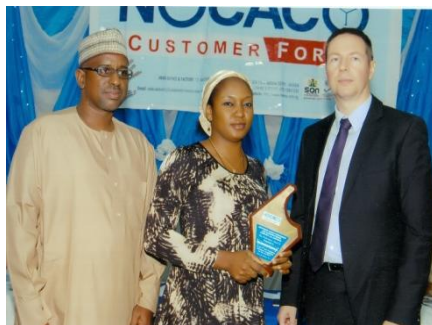
1 st Best Customer after Receiving Award

Distributors and Customers from various part of the country were present and awards were given to the 3 (three) best customers of the year.