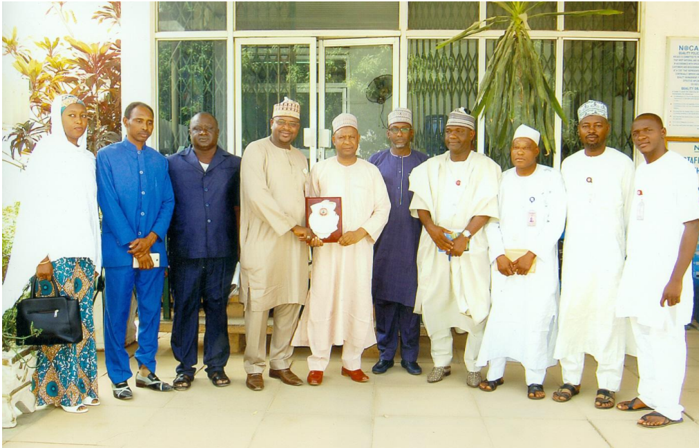
ITF Official presenting a Merit Award to Nocaco GM

Following Nocaco commitment to Human Resources Development, Nocaco was conferred a merit award as the Best Contributing Employer in Human Resource Development in 2016.