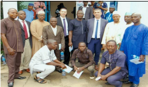
Group Photograph - 20year awardee