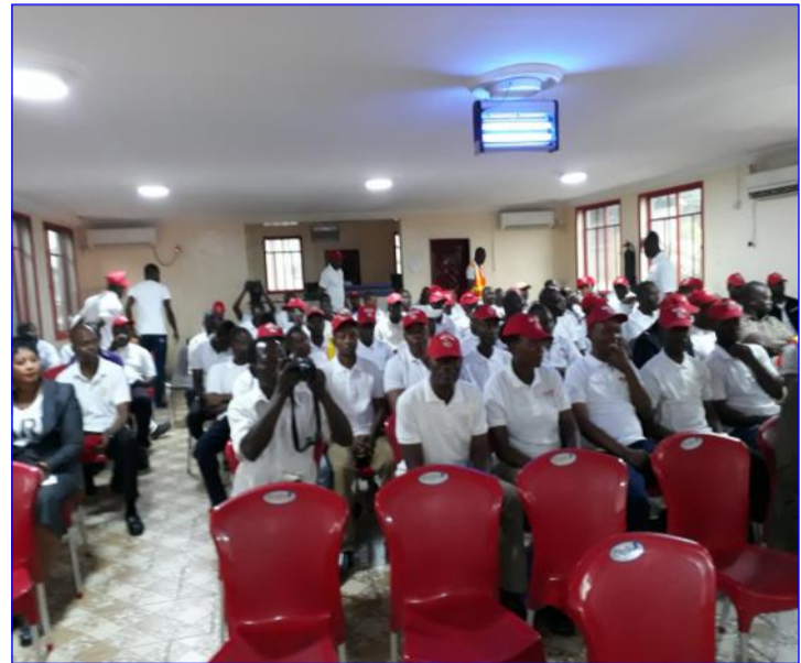
Members of staff of KABELMETAL Nig. Plc in attendance.