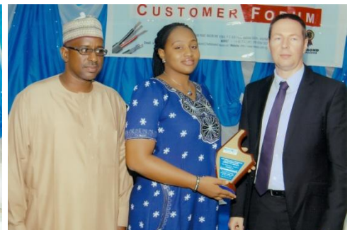
3 rd Best Customer after Receiving Award